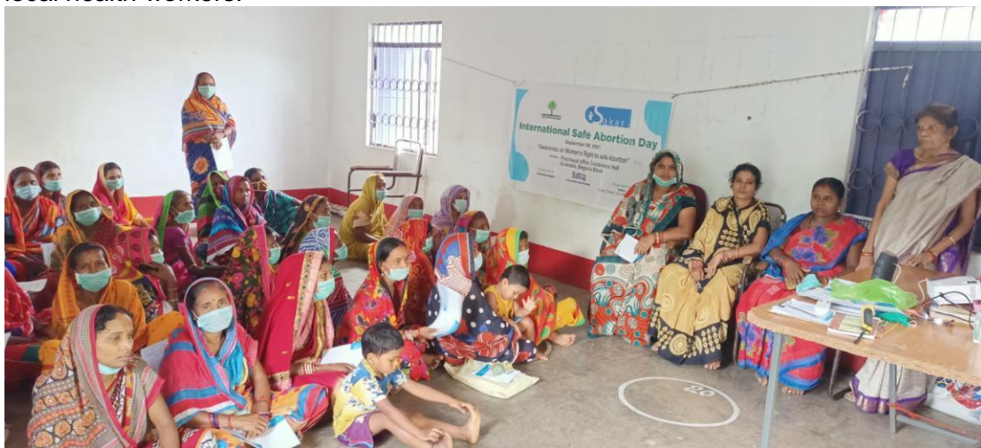
SAKAR observed international day of Safe abortionat Godatora village,Khurda dist.

Awareness programs were conducted for young adults on SRHR (Sexual Reproductive Health Rights ) A platform has been created for them to discuss about their issues under the guidance of School teachers NGO personnel and local health workers.